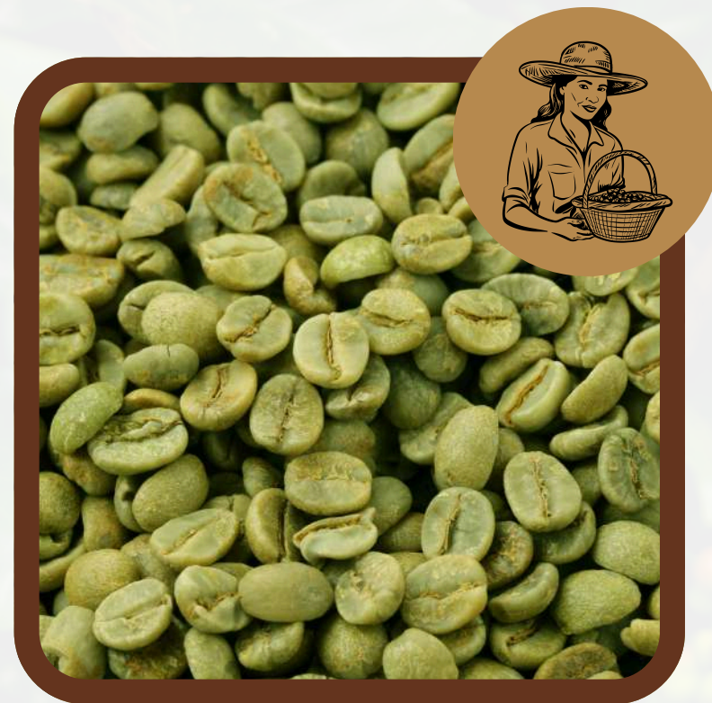
Green/Unroasted Coffee Beans

Our product range covers every major coffee format for the bulk buyer. We've sorted everything by type, format, and how you'll probably end up using it.