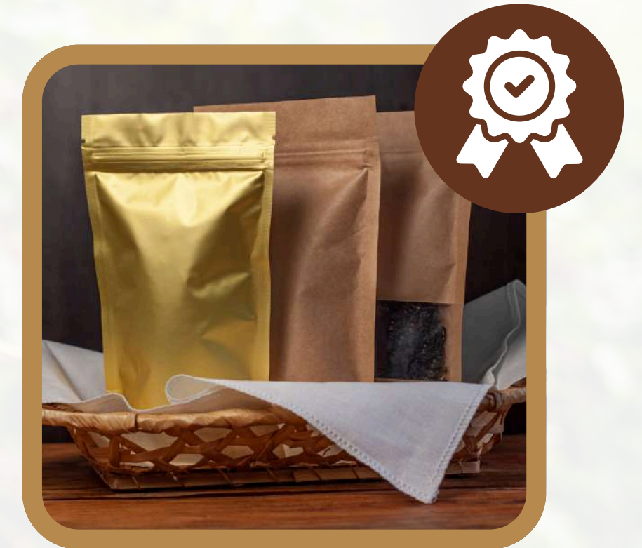
Microlots & Estate Coffee