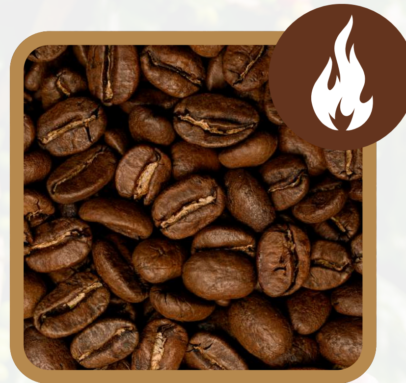
Roasted Coffee Beans